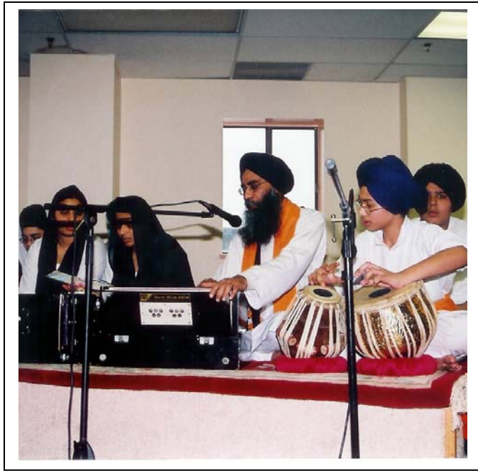
Kirten in the Darbar

Langgar was served at 2 pm. Hours later, a joyous sangat started returning to homes with the satisfaction and pride of a splendid Guru Ghar. An Akhand Paath was held in conjunction with the opening on the 16th, 17th and 18th of January 2004. The sangat left no stone unturned in making this Akhand Path a joyous affair. It was their way of saying thanks to Waheguru for his indulgence in His own home.