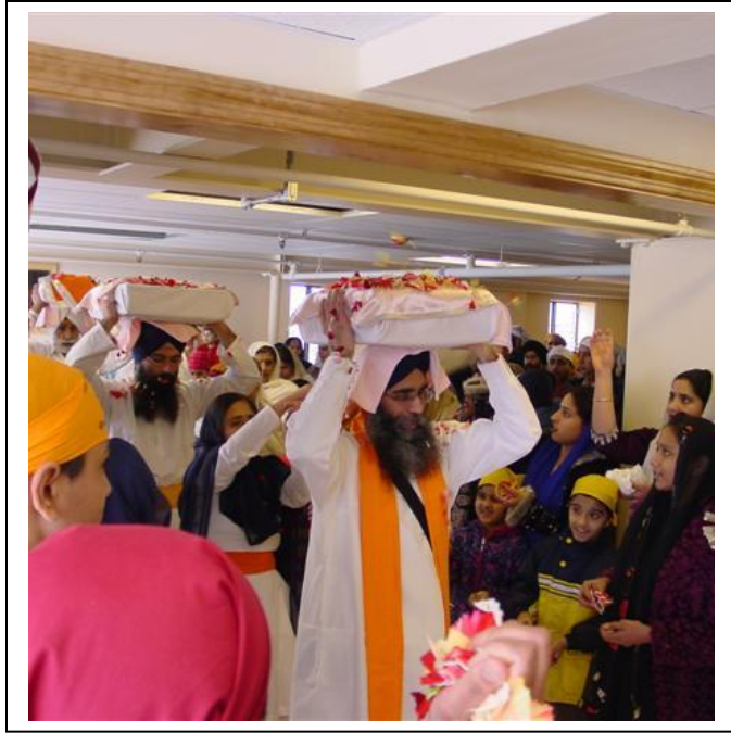
Swarees head towards Main Darbar

After the Hukamnama was read out, the sangat