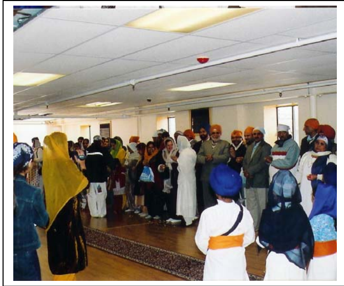
Sangat awaits arrival of the Swarees

The Swarees were led, in a grand procession, first by five junior pyares, who beamed in their Banaas, Kamarkasas, and small