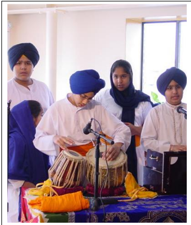
Guru Nanak Darbar Kirteni Jatha sings Charan Chalo Marag Gobind